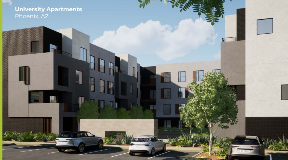
University Apartments Phoenix, AZ

The University Apartments is a market rate housing development designed to serve the needs of the staff and students of a private university in Phoenix valley, while at the same time attracting tenants from outside the university. This 282 unit project is located on a 7.23 acre site, across the street from the university campus.