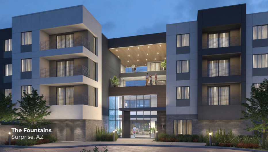
The Fountains Surprise, AZ

The Fountains at Surprise Center Apartments is a housing facility and development center built specifically to house players and officials of a professional major league baseball team during spring training. It is located across the street from the team's spring training facility.