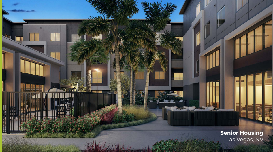
Senior Housing Las Vegas, NV

This project involves the design and development of a multi-building housing campus for seniors age 55 and older. The main building is a four-story, 160-unit apartment building that includes the campus club house, pool, spa, fitness room, conference room, business area, library, caterer's station, mail room, pet spa, snack bar and leasable storage lockers. Flanking the main building are 5 smaller two-story buildings, each comprised of 6 housing units and a private garage (for a total of 30 housing units).