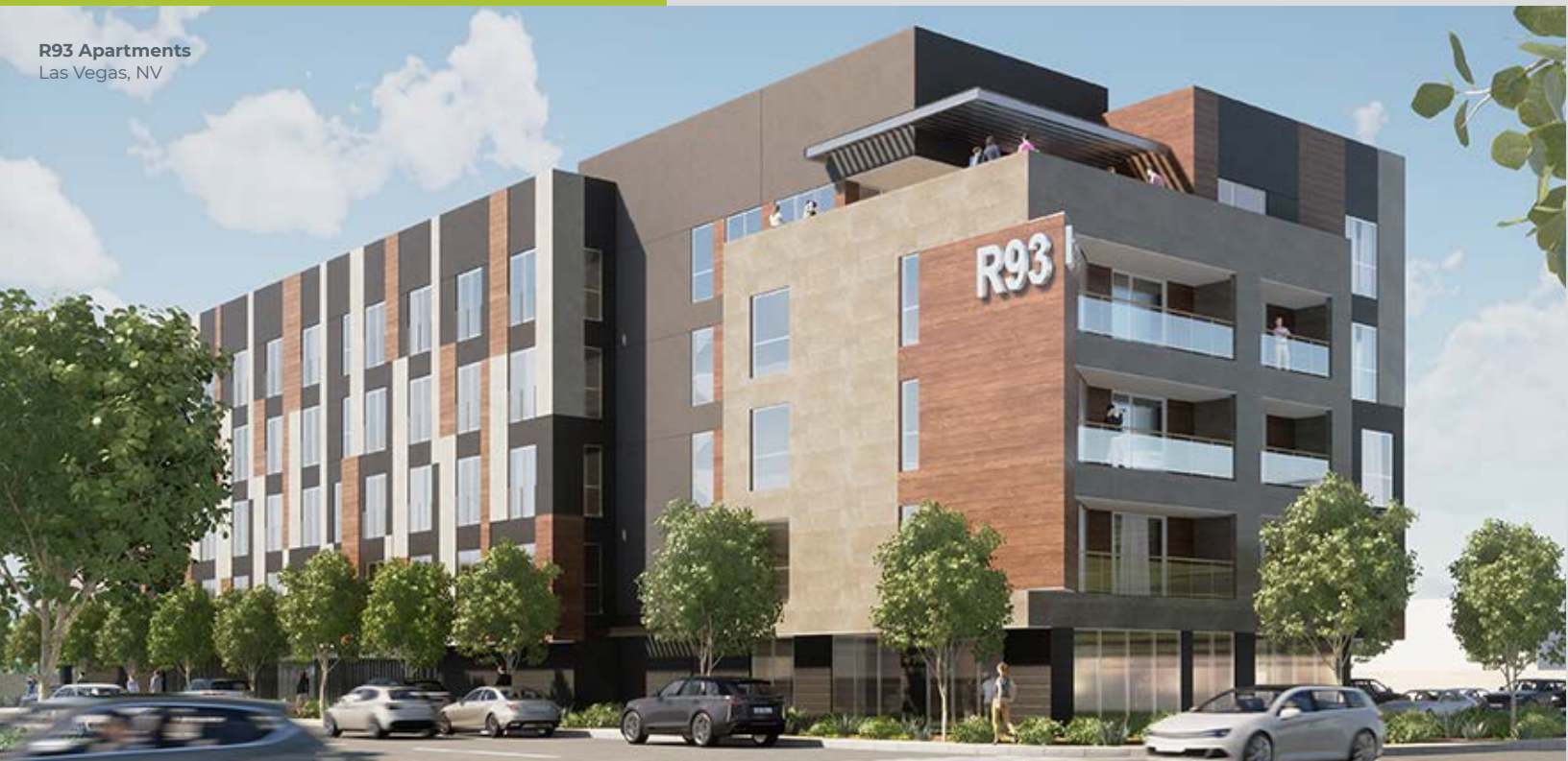
R93 Apartments Las Vegas, NV

T he DesignCell team understands that the success of every project ultimately depends on the ability to control the design process. Responsive leadership, collaboration and proactive approach is embedded into every layer of our work.