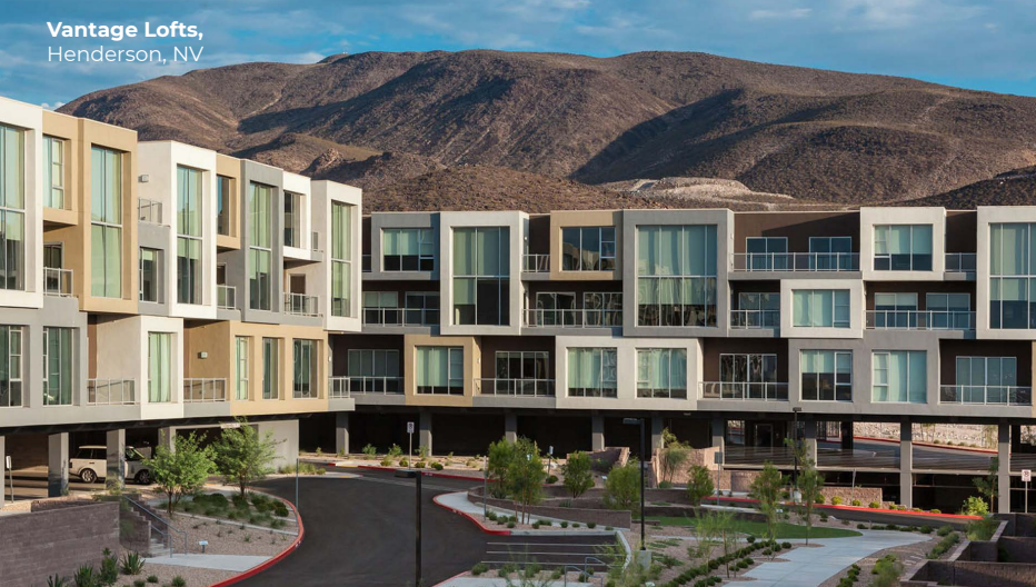
Vantage Lofts, Henderson, NV

Vantage Lofts Luxury Apartment Condominiums is an upscale community offering impressive views of the Las Vegas valley and all the amenities for luxury living. Designed to take advantage of its setting, buildings within the site are stepped to allow unobstructed views of the valley. Large floor to ceiling windows connect interior and exterior spaces and create an openness of modern living. A two level parking structure is located directly beneath the units, leaving the majority of the site for outdoor recreation and landscaping.